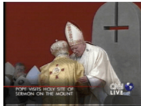
POPE JOHN PAUL II SEA OF GALILEE, ISRAEL MARCH 24, 2000

At right is Pope John Paul II at the Sea of Galilee in Israel on March 24, 2000. Notice the Satanic symbol of the upside-down cross on the throne set up for the Pope. The upside-down cross, signifies a reversal of Christian doctrine, ie. Antichrist doctrine, it symbolizes a mockery and rejection of Jesus Christ. 787