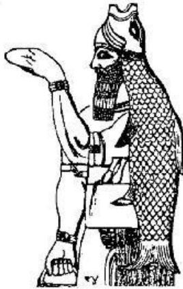
Priest of Dagon