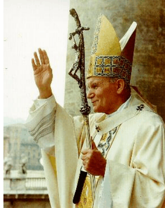
Pope John Paul II

The heathen customs of the clergy of Rome do not end with the zucchetos and tonsures. Alexander Hislop points out: "The two-horned mitre, which the Pope wears, when he sits on the high altar at Rome and receives the adoration of the Cardinals, is the very mitre worn by the priests of Dagon, the fish-god of the Philistines and Babylonians." 399 Notice the bowed crucifix in Pope Paul II's left hand. "I saw, and behold a white horse: and he that sat on him had a bow; and he went forth conquering, and to conquer." Revelation 6:2