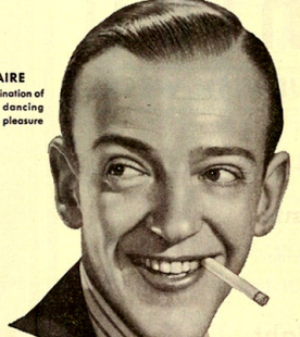
FRED ASTAIRE has the right combination of great acting and dancing to give you more pleasure