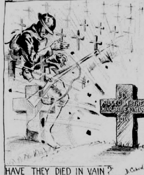
HAVE THEY DIED IN VAIN? J. Chel

It is as yet too early today to comprehend the full extent of the tragedy which has overtaken the world. The conflict has but started. It is now still limited to four countries. The extent of its possible spread is not as yet known. But the tragedy which has overtaken the millions of people in the war zone as well as the 3,500,000 Jews in Poland and the 800,000 Jews in Germany and her possessions is sufficiently great to defy the imagination and stir the deep sympathy of those who still believe in mercy, justice and the protection of the weak.