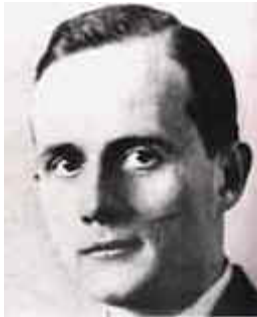
Ernst vom Rath

and paid his legal costs when he was arrested.