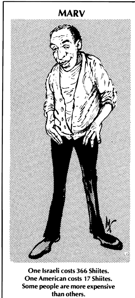
One Israeli costs 366 Shiites. One American costs 17 Shiites. Some people are more expensive than others.

□ White solidarity and survival have become forgotten issues in the affairs of whites. Witness our Civil War and the precipitate rise of belligerent nationalism in the past 100 years, which generated two major internecine conflicts, all in the face of a rising tide of color around the world. Oddly enough, the participants were not even perceptive enough to stop the carnage at the end of these decimating struggles, but recklessly continued the procedure by demolishing their immigration barriers to allow the invasion of their homelands by hordes of nonwhite aliens. This insanity was compounded by the admission into the U.S. of hundreds of thousands of Koreans, Vietnamese and assorted Asiatic and Cuban aliens. All that these invaders needed to do was utter two sacrosanct words, asylum and refugee, in order to be welcomed with open arms. These two words and "amnesty" are the cornerstones of our illegal immigration policy. Now there is yet another bill before the Congress to perpetuate this madness. It is the DeConcini-Moakley Bill (S. 377, H.R. 822), which provides for extending voluntary departure for El Salvadoran nationals illegally residing in the U.S. There are 500,000 of them here. Every effort should be made to defeat this bill.