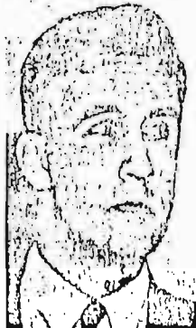
FRANCIS P. YOCKEY Final defiance