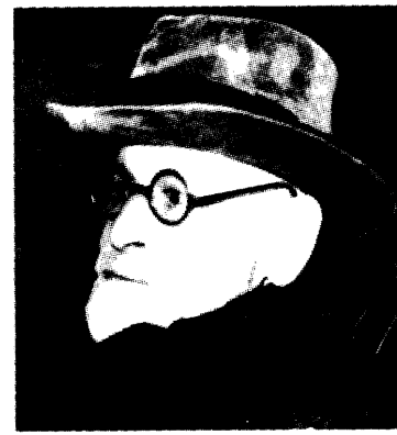
Freud at 82