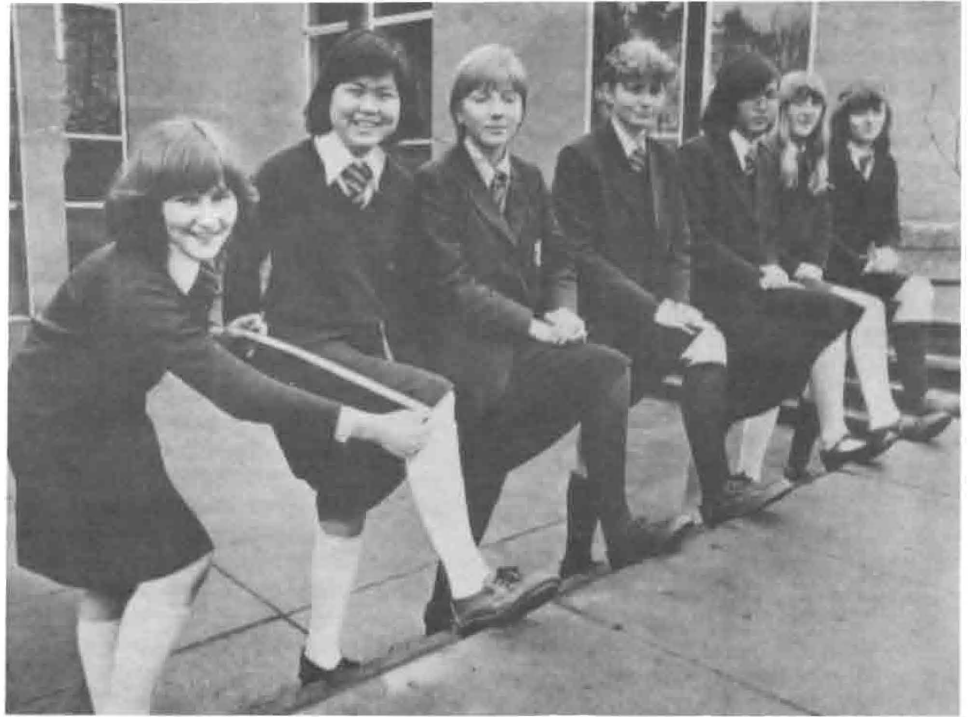
Integration in Ulster Seven Students at Friends' Grammar School in Lisburn

The Irish people were not always so Catholic. Before Henry VIII, England was strongly Catholic. When King Hank couldn't get the Pope to okay his divorce so he could