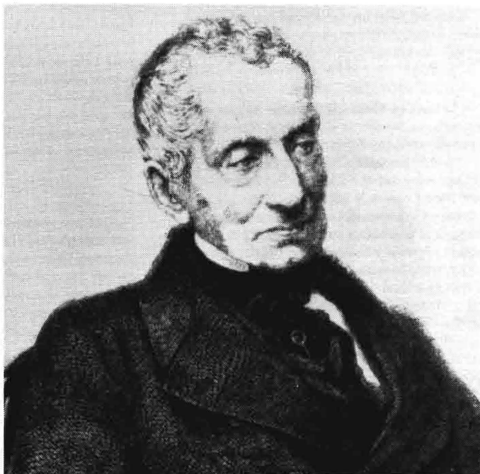
Classical Euroconservatives: Edmund Burke and Clement von Metternich