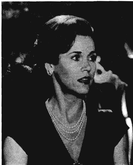
Fonda in her role as Chosenite Lillian Hellman

"I'm speaking to U.S. servicemen," she said in one broadcast. "I don't know what your officers tell you, but your weapons are illegal and the men who are ordering you to use these weapons are war criminals. . . ." As Fonda was spouting treason, our soldiers were dying in the fields and jungles of South Vietnam.