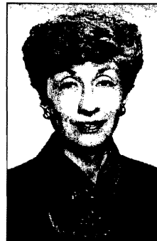
Chosenite INS Commissioner

Is there any difference whatsoever between Jewish gangsters and Jewish bankers?