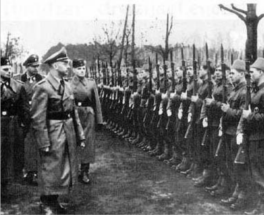
Himmler inspecting Muslim SS troops

Since Islam and National Socialism are so different, and irreconcilable, how can there be cooperation between National-Socialists and Muslims?