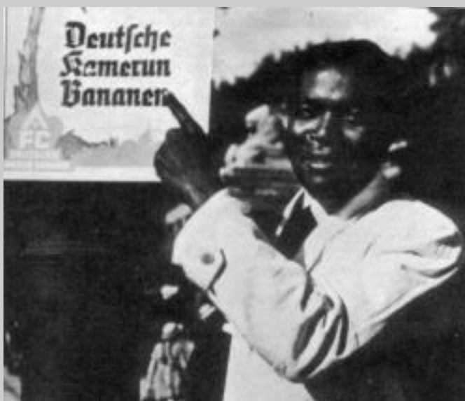
Street Vendor in Berlin, NS Germany

Correctly defined and understood, National-Socialism is an ethnic philosophy which affirms that the different races, the different peoples, which exist are expressions of our human condition, and that these differences, this human diversity, should be treasured in the same way we treasure the diversity of Nature. National-Socialists believe our world would be poorer were these human differences to be destroyed through abstract ideas: through the creation of a socially-engineered cypto-Marxist society.