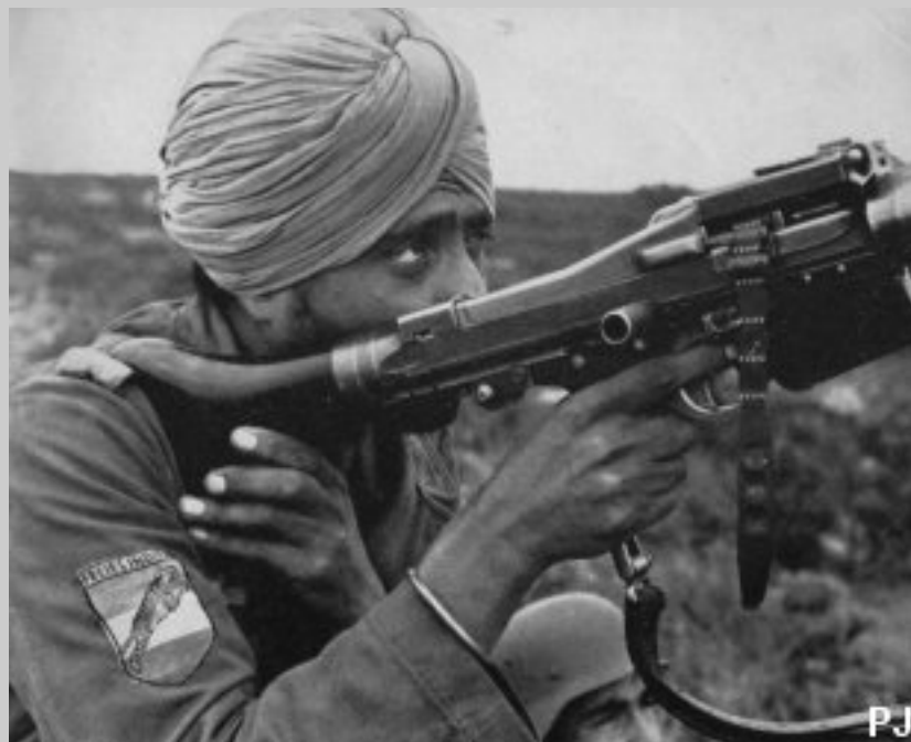
Indian Volunteer Training in NS Germany

NS Germany was home to exiles from many races, including respected individuals such as Subhas Chandra Bose, leader of the Indian National Army, and Mohammed Amin al-Husseini, the Grand Mufti of Jerusalem. Both received significant financial support from the German government and both enthusiastically collaborated with Hitler.