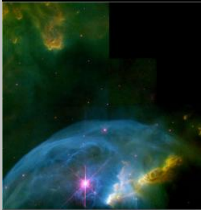
Nebula: NGC 7635

Quite a lot of modern astronomy and cosmology is pure, unscientific, speculation and there has been a tendency in recent decades for this speculation to be taught as "fact".