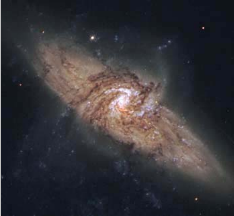
Galaxy: NGC 3314