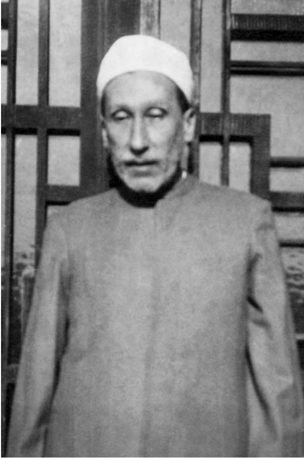
René Guénon in Egypt